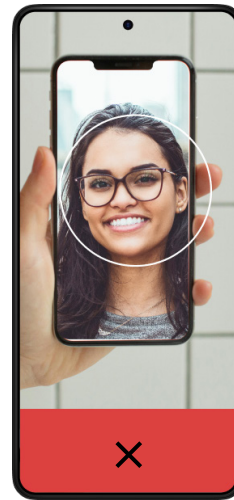
Hi-res digital photo