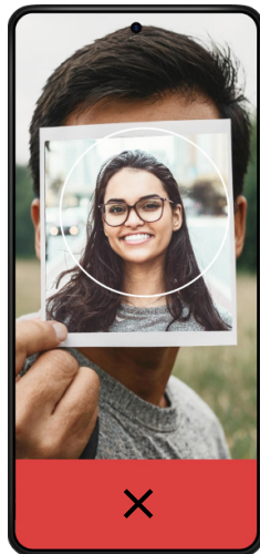
Hi-res paper photo